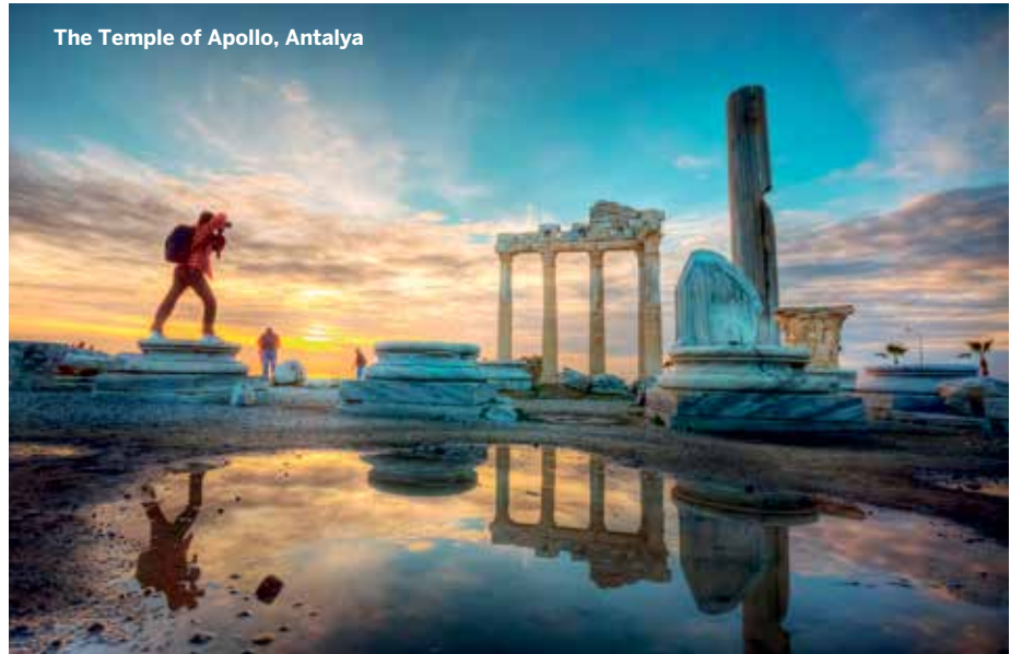
The Temple of Apollo, Antalya

during the winter you will not be bothered by the long queues and a sea of local and foreign tourists.